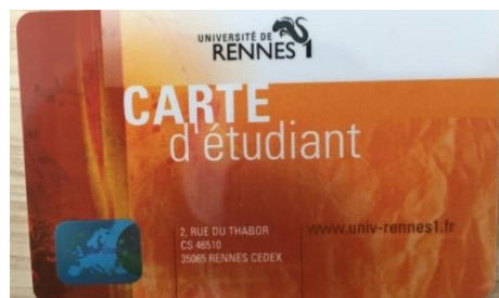
Figure 4: Front of the UR1 Student card including the ESC hologram.

The adaptation also required in some cases some technical adaptations or adjustments. For instance, it was not possible to automatise the process at UR1 for the personalised QR code integration on the cards. The IT department developed an application to gather the QR code issued by the ESC-Router on the one side and the student information issued by the student management system on the other side. The application not being “user friendly” was also an issue, as the student office that usually prints information on the card could not use it. This is why the IT department at UR1 produced the student cards for mobility students only. Those cards (see figures 4 and 5) were then printed by the student offices and afterwards sent to the mobility students. Via this process, 330 students received – in addition to their regular student card – a European Student Card, including the QR code. Although imperfect, this solution allowed UR1 and the EDUCardS consortium to test the issuing process of the ESC. Below you will find a sample of an ESC created at UR1: