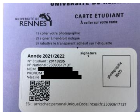
Figure 5: Back of the UR1 student card including the ESC QR Code.