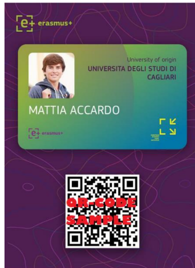
Figure 6: Virtual ESC example from UNICA.

However, generating ESCs with the Erasmus+ App does not allow universities to access data on how many cards have been created.